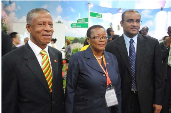
(l to r) The Hon. Tillman J. Thomas Prime Minister of Grenada; the Hon. Maxine McClean, Minister of Foreign Affairs of Barbados; and the Hon. Bharrat Jagdeo, President of the Republic of Guyana

Grenada is participating in the global event along with 13 other Caribbean Countries who are all converged in a joint pavilion under the leadership of CARICOM.