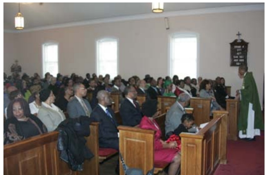
Worshippers at Independence Church